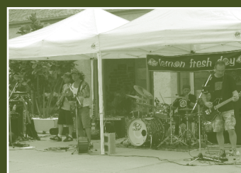
Tempo of Twilight