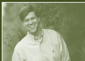
Guild Spring Luncheon