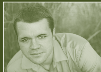
Summer Solstice Lecture